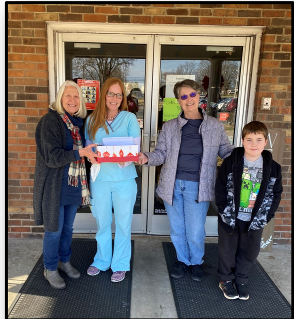
TCGC members made pressed flower Christmas Cards which were delivered to residents at Colonia Center December 20, 2022