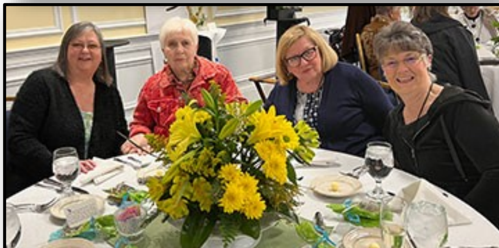
TC members at GCKY Convention in Berea.