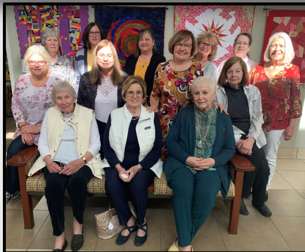
TCGC hosted the spring meeting of the Cardinal Council.